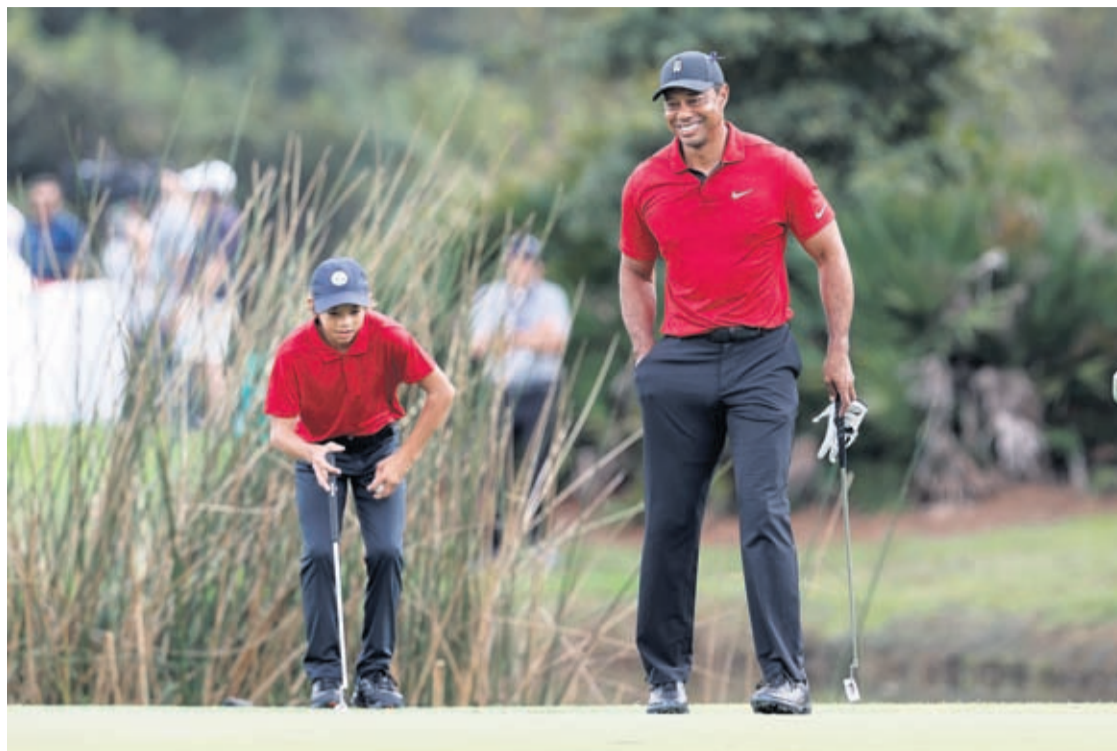
Tiger Woods smiles while walking on the second green during the second round of the PNC Championship golf tournament Sunday, Dec. 19, 2021, in Orlando, Fla.

It was like that over the final two hours, Woods often hitting the key irons and Charlie making the putts. They briefly had the lead after a